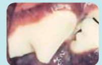
Healthy mouth with white teeth and healthy pink gums